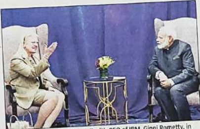
Prime Minister Narendra Modi with CEO of IBM, Ginni Rometty, in New York on Wednesday

New York: Prime Minister Narendra Modi on Wednesday suggested that individuals have ownership of their personal data, stating that the government will strive to strike a balance between data security and privacy with openness.