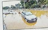
Maharashtra chief minister Devendra Fadnis said he was pained to know about the loss of lives due to heavy rain in Pune

Five people sleeping in a dargah in Khed-Shivapur village, located on